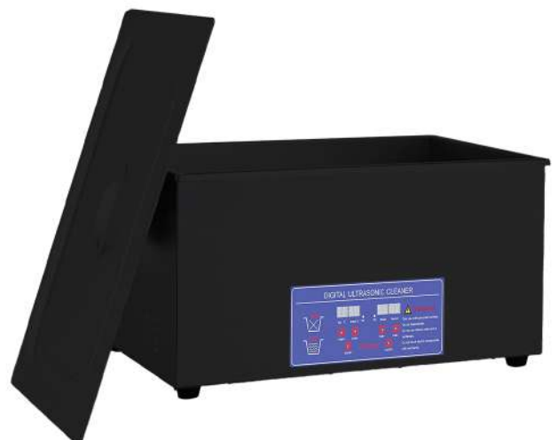
WASH TITAN 20 L