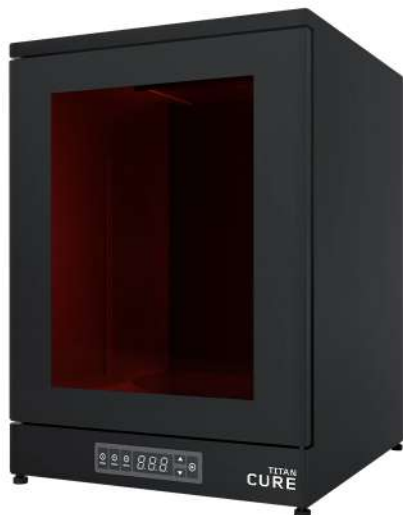
CURE TITAN 400 x 400 x 450 mm CAPACITÀ INTERNA

*ALCUNI DATI POSSONO VARIARE PER MOTIVI TECNICI DETAILS MAY BE CHANGED BECAUSE OF TECHNICAL REASONS